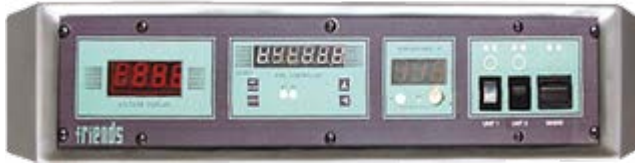
Programmable Operational Panel of Foil Printing Machine (Detachable Socket System)