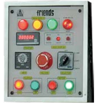
Operational Panel Side Mounted (Detachable Socket System)