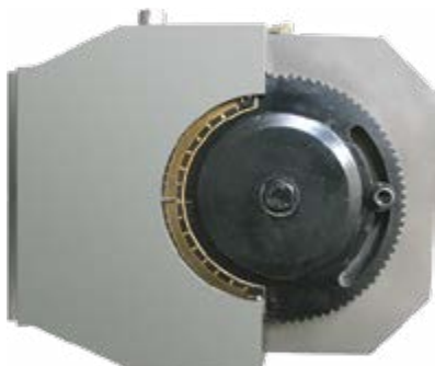
Impression Adjustment by Worm Gear & Eccentric Bushes