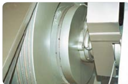
Electromagnetic Clutch & Brake System for Microns Adjustment