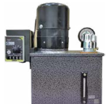
Auto Lubrication Pump